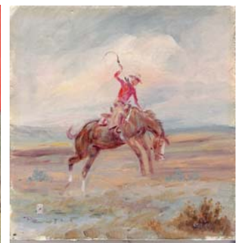
Page 4 Annual Fund Drive