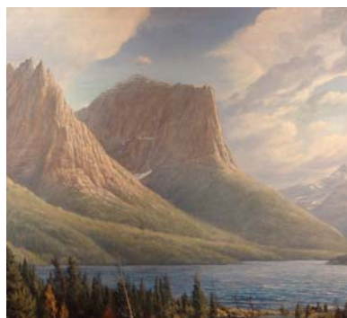
Page 8 Recent Acquisitions