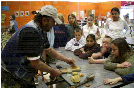
Traveling Medicine Show in Action

In its first three months the Traveling Medicine Show visited a total of 2,500 children and adults in twelve schools. Everywhere it went, it was a resounding success! If we are able to secure adequate project funding for academic year 2007-2008, the Show will travel to 5,000 children and adults in twenty-five schools.