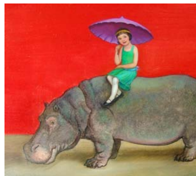
Page 3 Members Salon