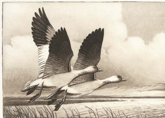
Jeff Walker "Duck Stamp Entry" Etching